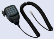
■ MC-59 16-Key Hand Microphone