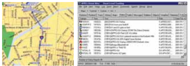
"APRS+SA" was written by KH2Z (Brent Hildebrand)

■ Positional/directional data: With an NMEA-0183 compatible GPS receiver, in addition to current latitude, longitude and altitude, information is available on the distance, speed and heading of a mobile station.